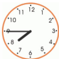
15 till 8, OR a quarter till 8